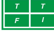
TABLE TENNIS FEDERATION OF INDIA